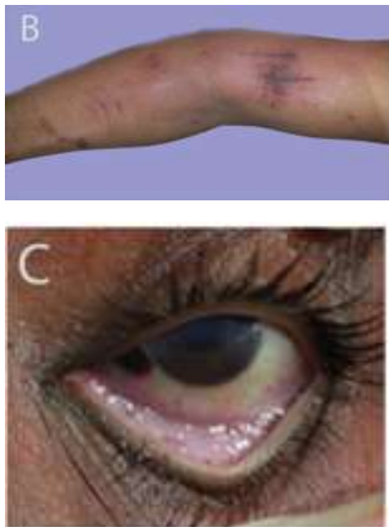
Figure 1: A-Irregular abrasion on the anterior aspect of the thorax and neck. B-Abrasions on the left forearm, C-Petechial haemorrhages and conjunctival haemorrhage in the left eye

deceased was a small-built young female. There was an irregular abraded contusion of 10 x 6 cm in dimensions placed over the anterior aspect of the root of the neck and superior part of the thorax more towards the left side. (Figure 1A). There were multiple linear abrasions over the left forearm (Figure 1B). Additionally, there were multiple grazed abrasions placed on the lateral aspect of the right thigh, on the left arm and on the posterior aspect of the right shoulder. Further, there were several irregular abrasions on the face. There were petechial haemorrhages on conjunctivae of both eyes, nasal bleeding and congestion above the neck of the body. There were no lip injuries or peri-oral injuries. No gagging material was found within the throat during the autopsy. There were no markings suggestive of a ligature mark around the neck or any tramline contusion elsewhere on the body.