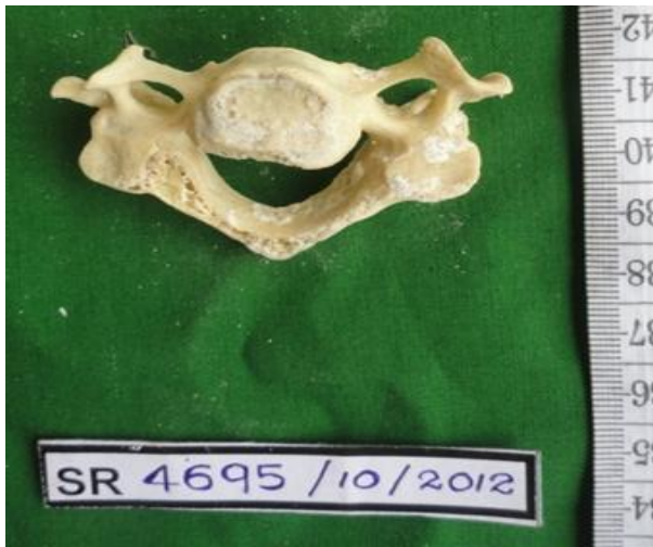
Photograph 05 : cut fracture of the 4 th cervical vertebra