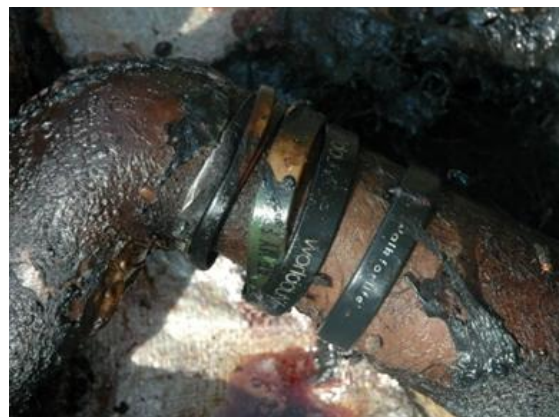
Photograph 02: friendship bands

Missing person’s data and post-mortem data were obtained using Interpol Disaster Victim identification forms. Although general identification was possible using matching data specific identification was impossible using conventional methods such as finger prints and dental pattern due to burning and absence of a dental chart during life.