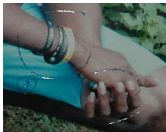
Photograph 03: friendship bands in the missing person

Soot was not found in the respiratory tract. Test for carbon monoxide reported negative. There were no identifiable ante-mortem injuries of either blunt or sharp force trauma to arrive at a cause of death. The dismembered bony ends showed sharp cuts at several sites, cervical spine, lumbar spine, femurs and humerus. (photographs 4-9) Radiological investigations did not reveal presence of bullets or pellets emitted from a firearm. Stomach contents reported negative for common poisons. Further investigations of the missing person’s last movements led to the original crime scene at a room in the 4 th floor of a building. Although the primary site had been “washed away” remnants of the blood stains were enough to reconstruct the events.