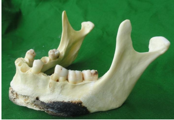
Photograph 04 : burn and cut fracture of mandible