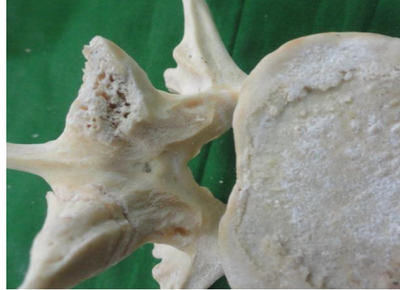
Photograph 06 & 07 : Partial and total cut injury of the right and left superior articular processes of 4 th Lumbar vertebra