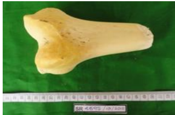
Photograph 08 & 09 : cut ends of humerus and femur